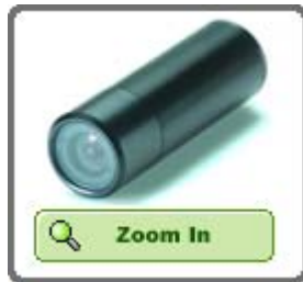
19B-W36 Weatherproof Lens Exchangeable 0.5Lux/F2.0