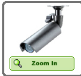
Option 19B-W36 with Sunroof